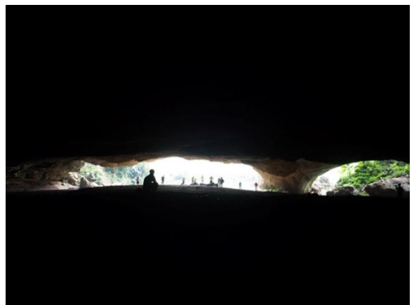
Looking out of the lower entrance of Hang En

The river took a sharp turn and split, part of it spilling into a low, wide opening in the cliff – the lower entrance to Hang En. The group took a break and our guides handed out helmets and lights (Hope R4s) to eager hands. Finally we were in a cave!