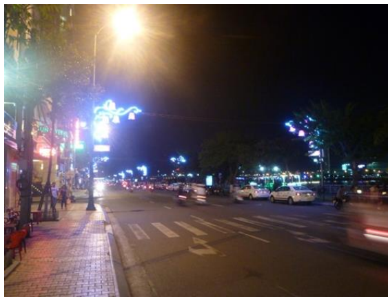
Late night out at Da Nang

The Waterfront Bar in Da Nang shall forevermore be the CCC hangout in Da Nang. Copious quantities of San Miguel Beer were consumed that evening at the enormous cost of about 800,000 dong each. Granted, this seemed to have been the most expensive bar in Da Nang, but that still equates to food and drink for a whole evening at about $40 each. Not bad at all, and all served with a smile and great quality.