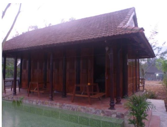
Vietnamese architectural style of our accommodation

Our accommodation was very good for the $30 we were paying a night. Vietnamese architecture is unique, long and narrow, and our rooms were situated at the back of the family house, in a traditional style house facing the river. Comfy, if somewhat firm, mattresses, fans and mossie nets (think Cairns in summer) made for a decent first nights sleep. The food was excellent too – delivered on a scooter from down the road from a menu brimming with interesting items – I still stand by Wonder Balls. Simply the best!