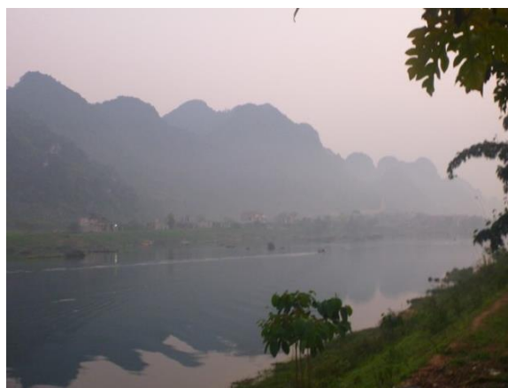
Dawn over the river at Phong Nha