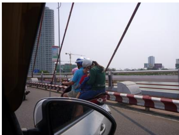
Family of five on a scooter !!!

There are rules, but no one really follows them. It's a mixture of knowing the right thing to do and just moving with the flow. As long as you keep moving, steadily, in the direction you want to go, everything will be fine. Most of the time anyway. Seeing a family of five travelling on a Vespa scooter, or a mattress being delivered on the back of a motorcycle is worth the price of admission by itself.