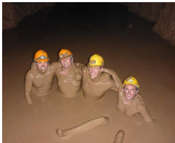
The crew enjoying the mud wallow

eyes and imagine swimming in thick, smooth, chocolate cream and you will have some idea of what this little experience was like. It's like swimming in the Dead Sea, you actually float on top of the mud. Amazing.