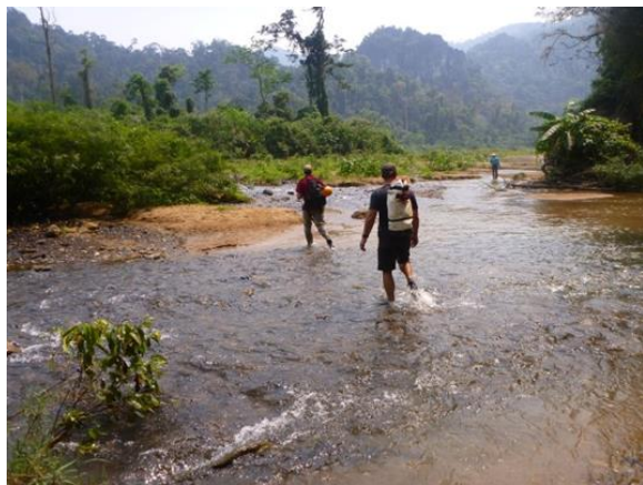
One of the many river crossing on the trek in

This, we were told, was a legacy of the rainforest being massively bombed and never recovering. The history of this land is replete with death and suffering, and hearing it from the Vietnamese perspective is sobering. One example was a bridge named the Bridge of Blood and Diesel – so named because many people lost their lives carrying canisters of diesel on their backs across the river during the Vietnam War. People carried the canisters because trucks were too easy to bomb... and many died.