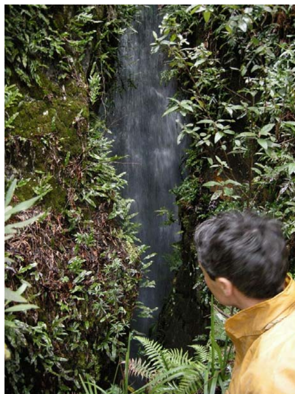
Looking down the entrance influx

We climbed down past the most excellent waterfall dropping away into the Misty Void with awesome visuals created by the mist and sunlight.