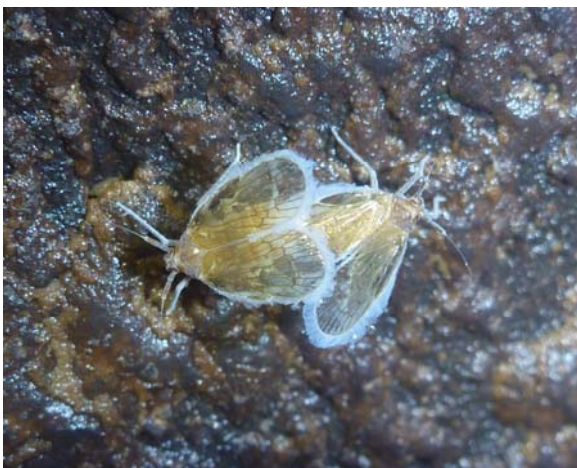
Solonaima sp. mating in 'Ball Pit'

This might be a new species, or Solonaima irvini (Hoch & Howarth 1989) which is described from the Markham Tower complex. No specimens were collected, but the small population is interesting to note.