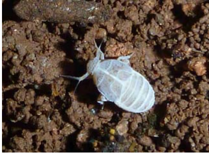
Cave Plant Hopper