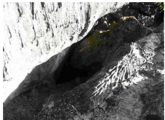
The vertical entrance to CH532