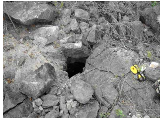
Entrance to CH535