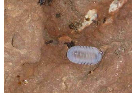
Cave Terrestrial Isopod

The club executive were able to secure Public Liability Insurance in November, covering the club property. In addition all the infrastructure at the club is now insured for loss in fire. The insurance premium which has to be