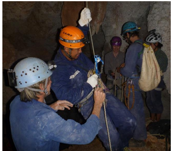
Some rope practice at the base of the new pitch