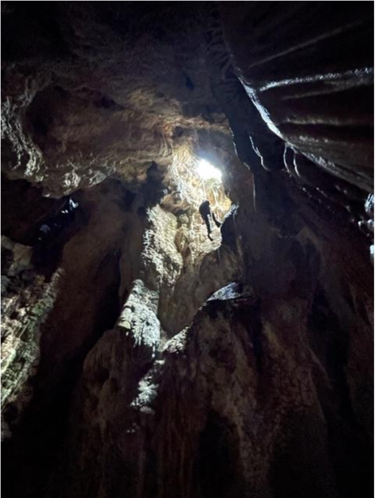
Abseiling into Rescue Cave