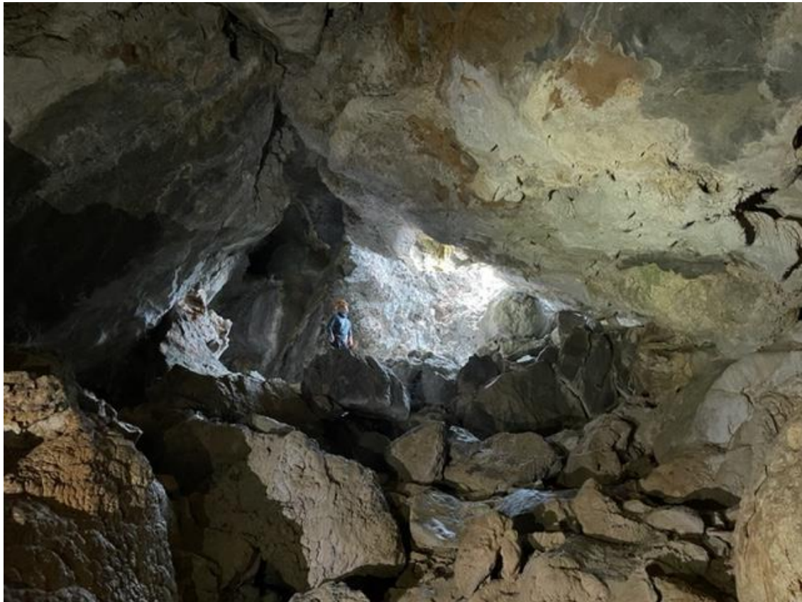
Tall Trees Cave, Chillagoe